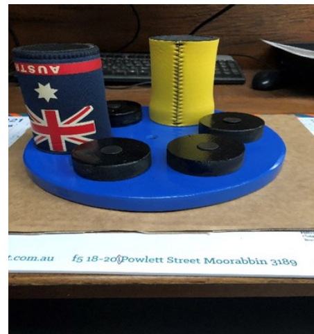
Some nice-looking stubby holders made by Alan & Vaughn

An innovative use for an old bathtub. Image found on the Internet.