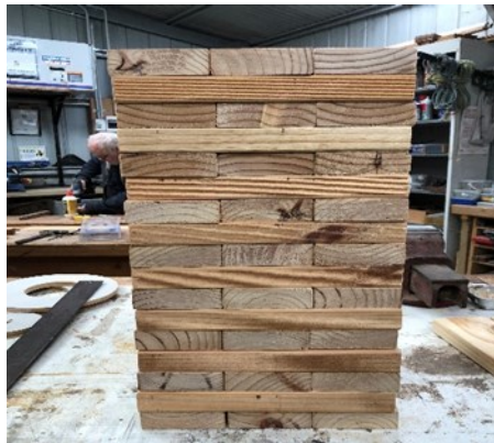
Completed Jenga set

The Edithvale Primary School have asked us to build some outside toys for the kids at the school. We have decided to build giant Jenga blocks, Noughts and Crosses and a Connect 4 board. This is a good project for the Shed, and we have all the necessary wood to do this without having to buy any wood.